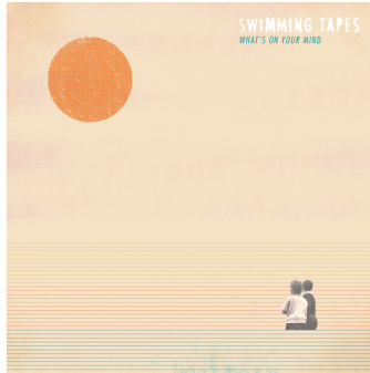
Swimming Tapes - What's On Your Mind

Keep in touch with other latest news at amazingtunes.com , Amazing Radio , Amazing Record Co. , Amazing Instore , and Our Stage , or find us on Twitter, Facebook, Instagram and YouTube!