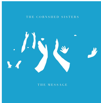
Cornshed Sisters - The Message