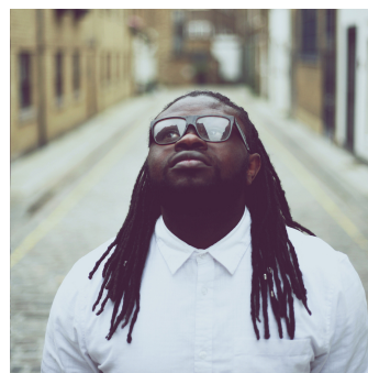
Midé All Over The Wire