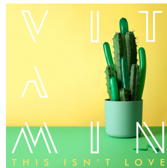
Vitamin This Isn't Love