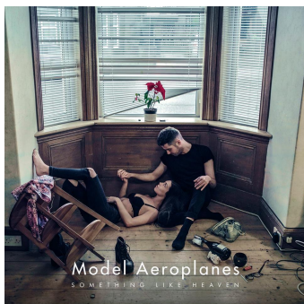
Model Aeroplanes Something Like Heaven

Here's a few picks from our favourites of this month's uploads