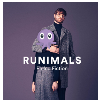
Philco Fiction Runimals