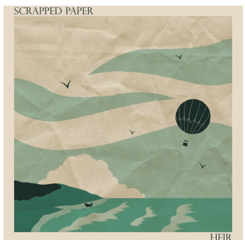
Heir Scrapped Paper