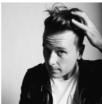
The Wild Wild Ghost Of 1941