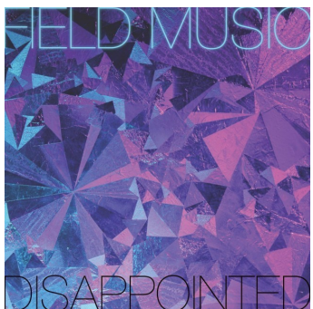
Field Music Disappointed