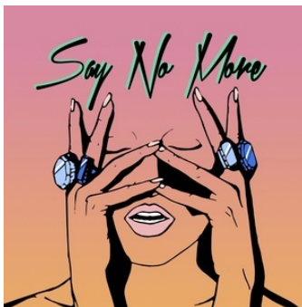
Fickle Friends Say No More