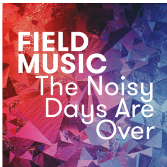
Field Music The Noisy Days Are Over