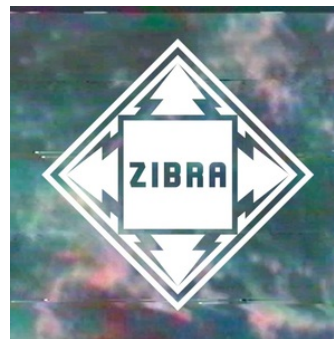
ZIBRA Wasted Days