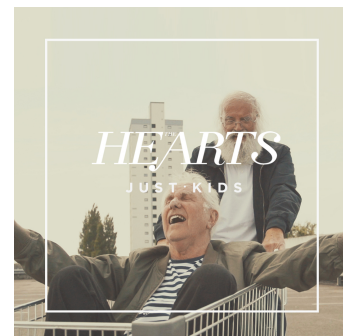
The Hearts Just Kids