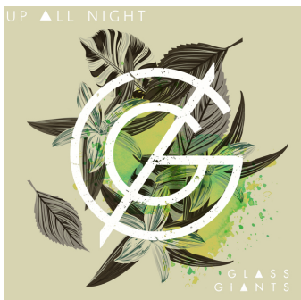
Glass Giants Up All Night