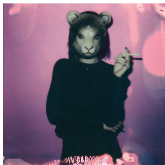
Elohim She Talks Too Much