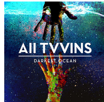
All Tvins Darkest Ocean